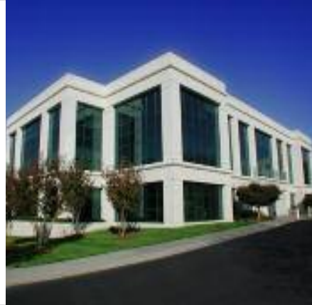
tesa tape, inc. Charlotte, North Carolina North American Regional Headquarters