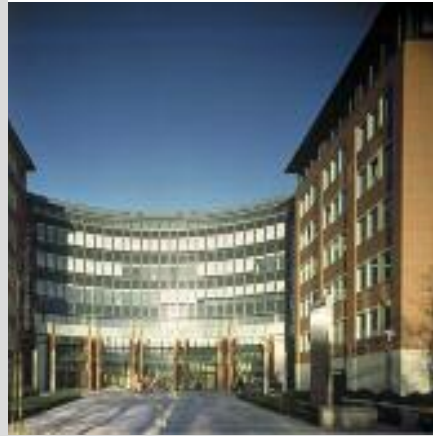
tesa AG Hamburg, Germany Global Headquarters

With more than 3,700 employees across 51 subsidiaries around the world, tesa stands committed to exceptional customer service on both a global and local basis.